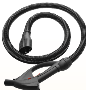
Handle with hose