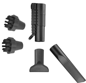
Steam lance adapter