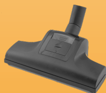
High efficiency turbo brush