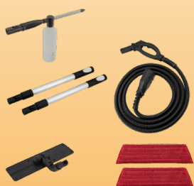
Kit sanitation maxi