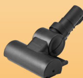
Vaporizing turbo brush