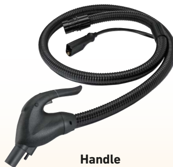
Handle with hose