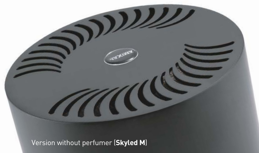
Version without perfumer (Skyled M)