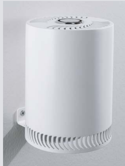
Complete with bracket for wall mounting