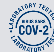
Virus Sars-CoV-2 (inactivated strain)