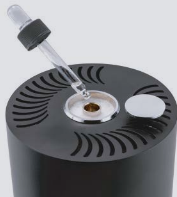
Version with perfumer (Skyled ME)

The photocatalytic process was discovered by the Japanese Akira Fujishima in 1972 and then was regulated by NASA to be used in places where the maintenance of environmental sterilization was essential. It was then studied and developed by hundreds of universities, as well as public and private research centers. It is a safe system to hinder pollution in confined spaces. From all these research and development studies, was born the technology used by SkyLed.